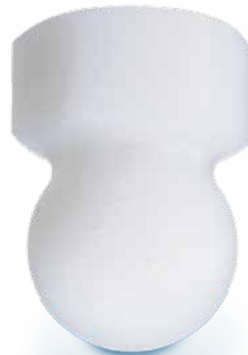
TankJet VSM tank cleaning nozzle for tanks up to 5' (1.5 m) in dia.